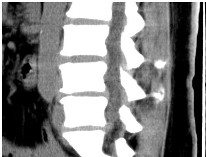
Figure 2 Sagittal CT image showing large L5-S1 disc protrusion with degenerative disc changes at L4-5 and L5-S1 and mild bulging of the L4-5 disc.